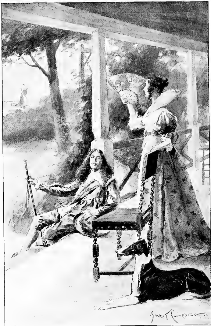
“WHY ARE YOU SO EAGER?” (Page 2)